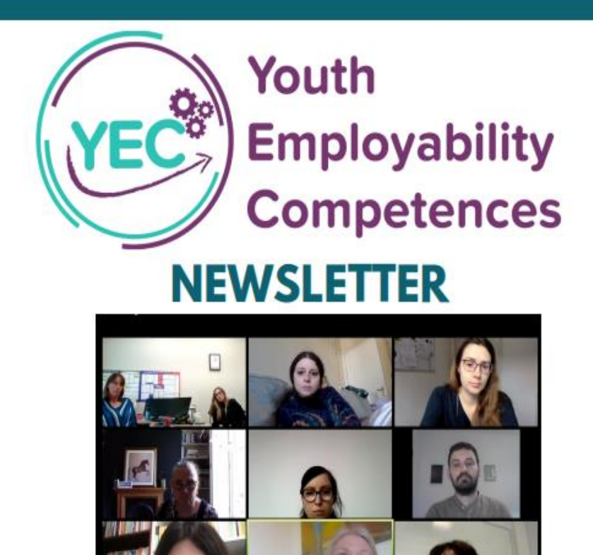
Figure 2: YEC Newsletter 3 May 2021